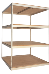
Bulk Storage Rack

They're simple and wider. Two basic components... beams and posts snap together without special tools. And you can save money using particle board and similar shelf surfaces. Best of all, wider shelves offer more uninterrupted storage space for bulky items. Ideal for medium-duty loads.