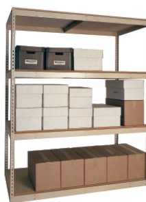
Record and Archive Storage