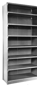
8 Shelf Closed Unit