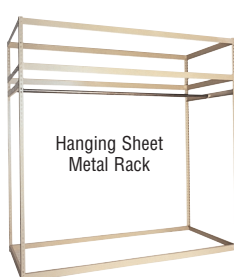
Hanging Sheet Metal Rack